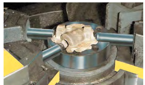
Minimizing the weight using the hollow part method