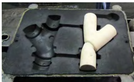
maximum material savings