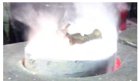
view of melting furnace