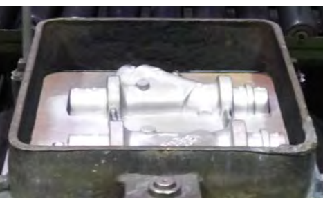
moulding box with valve contour

Various alloys of bronze, brass and aluminium are used as raw material for casting. Our product designers and our team develop integrated solutions according to your requirements - from concepts to finished products - from ideas to production conditions. We accompany our customers during the entire "design to manufacture" process. From visualized, weight optimized 3D prototypes suitable for casting and production to mould construction and making of moulding boxes to a lean, cost-efficient, machined production process in small and large batch production.