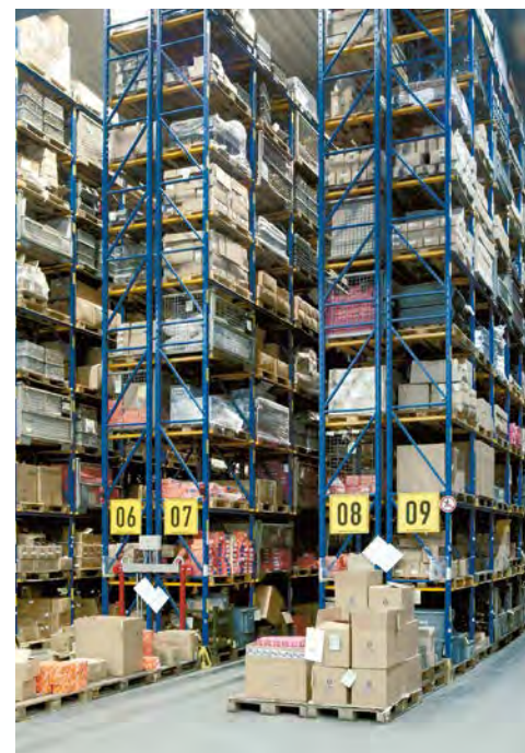
High bay warehouse

Environmental protection is an important topic for us. The copper-zinc alloys that we process are 100% recyclable and thus save resources. Water preparation and suction technology in our electro-plating shop and the hot forge guarantee optimal environmental protection.