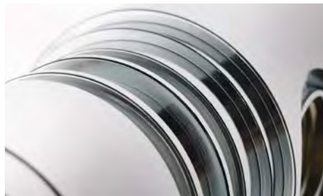
Nickel/chromium layering system