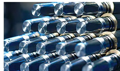
Stainless steel lathe-turned parts