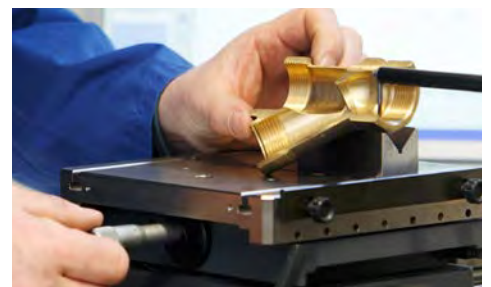
Dimensional inspection using the reflected light method