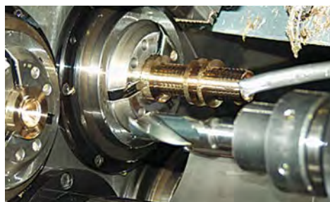
Machining of lathe-turned parts