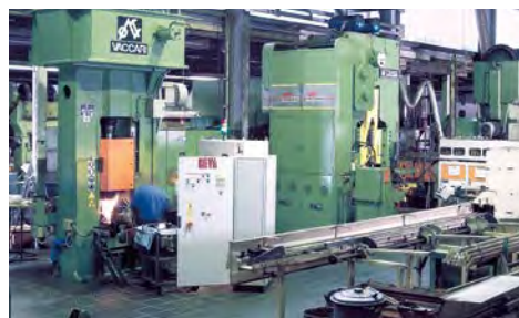
Economical due to the use of modern drop forging machines